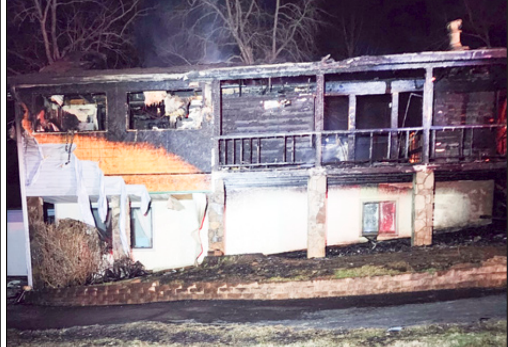
Given the progression of the blaze firefighters faced when they arrived, it's miraculous this home kept standing that evening.